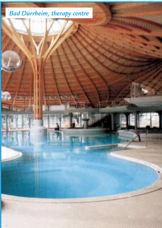
Bad Dürkheim, therapy centre