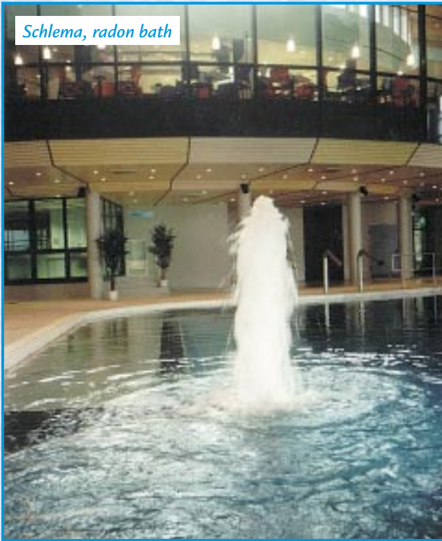
Schlema, radon bath