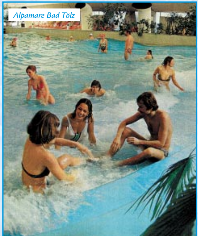
Alpamare Bad Tölz